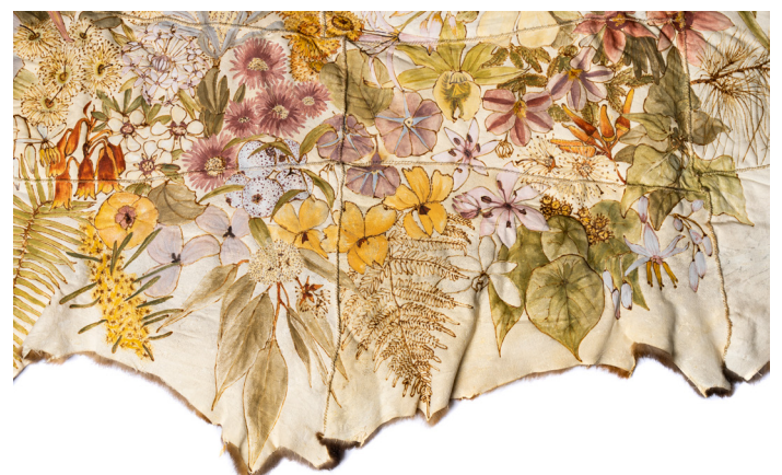
Carol MCGREGOR, Wreath for Oodgeroo (detail) 2020 possum skins, charcoal, ochre, binder medium, waxed thread. Courtesy of the artist. Photo by Louis Lim.